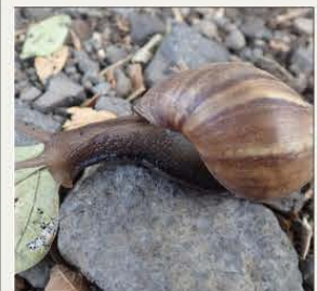
Giant African Snail

Giant African Land Snails can cause structural damage to buildings by eating stucco and other materials that contain calcium!